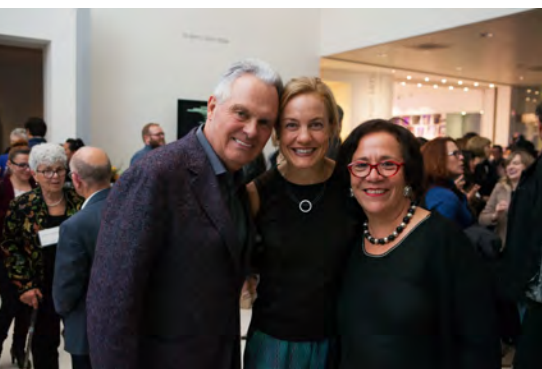
LEAVE A LEGACY

MOPA is pleased to work with you or your financial advisor to craft a planned gift that meets your charitable and financial goals. Please contact your financial advisor and share your plans with the Development Office at development@mopa.org or 619.238.7559 x300.