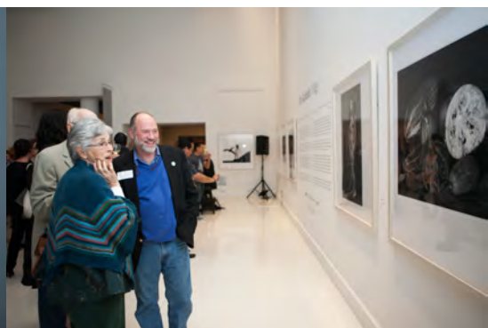
BUILD FOR THE FUTURE