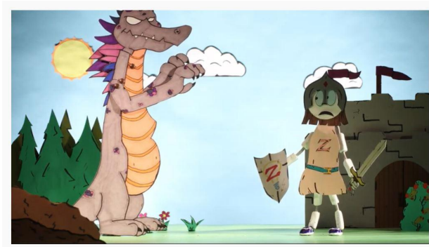
SCREEN SHOT FROM ALL ABOUT STOP MOTION BY STEVEN TOPHAM